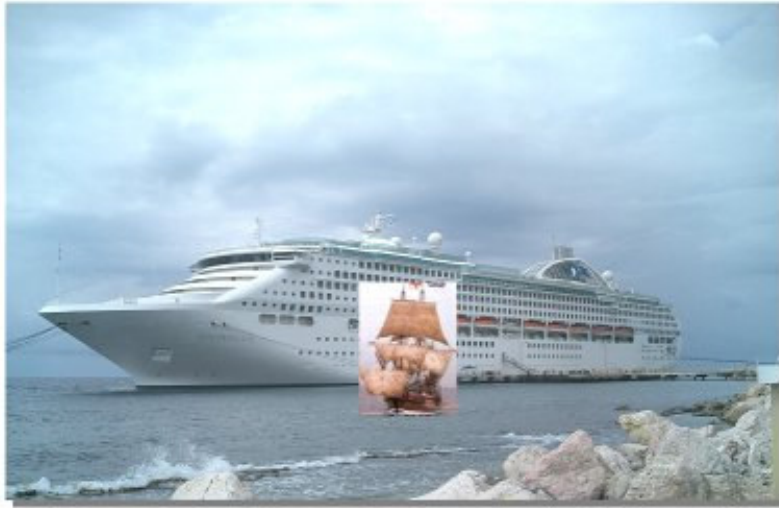
A modern cruise ship vs. The Mayflower

Hebrews 11: 13-16 “These all died in faith, not having received the promises, but having seen them afar off were assured of them, embraced them and confessed that they were strangers and pilgrims on the earth . 14 For those who say such things declare plainly that they seek a homeland . 15 And truly if they had called to mind that country from which they had come out, they would have had opportunity to return. 16 But now they desire a better, that is, a heavenly country . Therefore God is not ashamed to be called their God, for He has prepared a city for them. ”